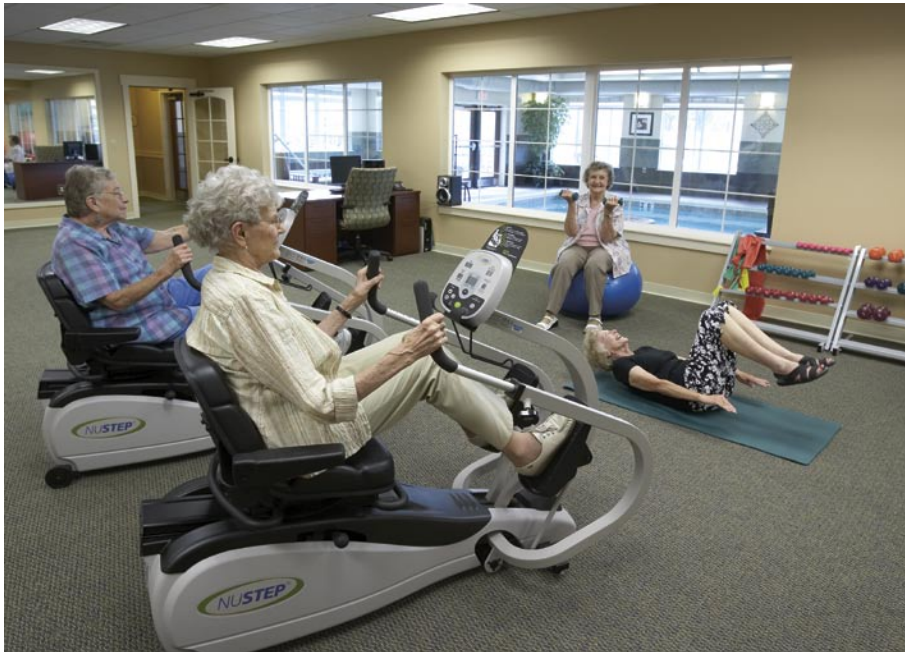
Keeping healthy is as much a part of life at MacKenzie Place as anything. Their state-of-the-art facilities and classes offer residents a variety of ways to keep fit and active.